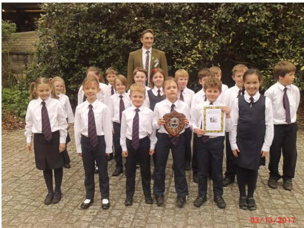
1 st Place for our Year 3 Choral Speakers.