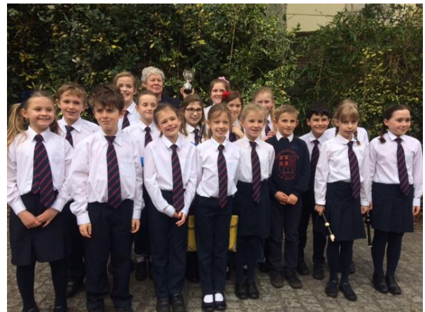
1 st Place for our Recorder Players.