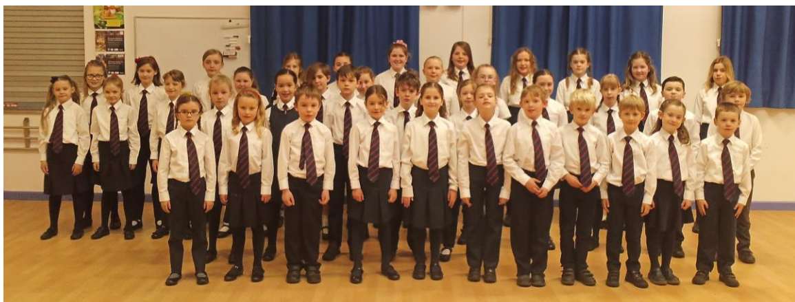
3 rd Place for our School Choir.