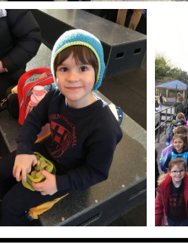
So many exciting things to see!