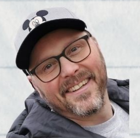
KINGFISHERS SIMON COURT