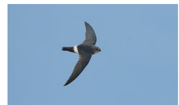
Swifts – Year 6