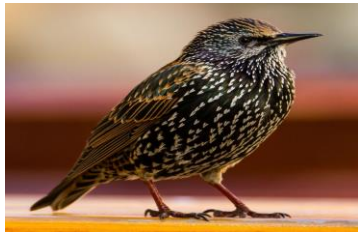
Starlings - Year 3