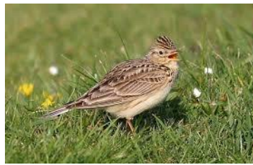
Skylarks – Year 4