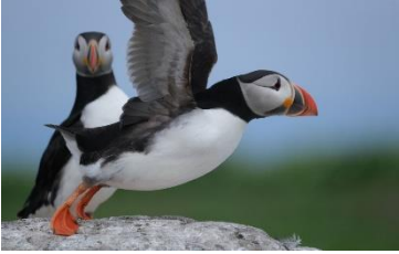
Puffins - Reception/Year1