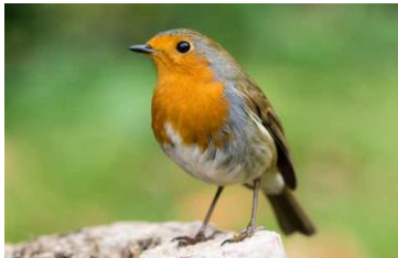
Robins - year1/Year2