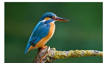
Kingfishers – Year 5