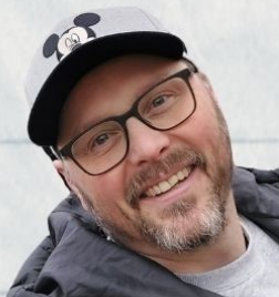
KINGFISHERS SIMON COURT