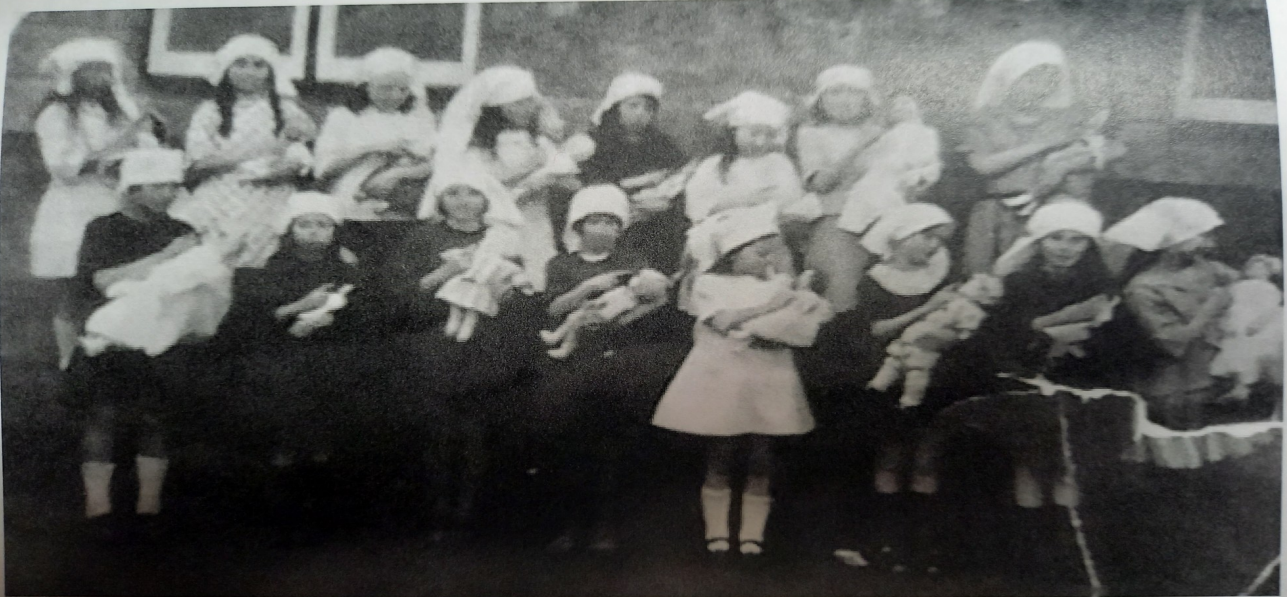
This undated photograph of a group of girls with their dolls was probably taken around the mid-1920's. Sadly, no names are recorded.