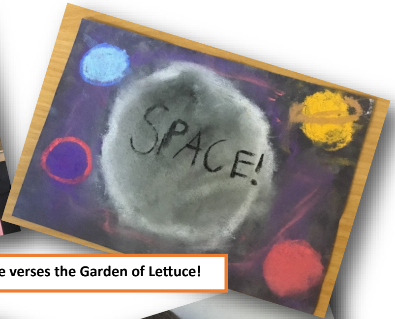
The Science of Space versus the Garden of Lettuce!