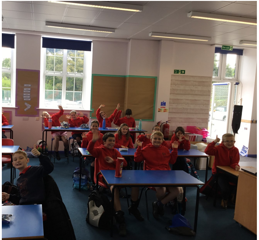
Our new Kingfishers making the most of their amazingly spacious classroom with plenty of room spread out and have several small group teaching spaces.