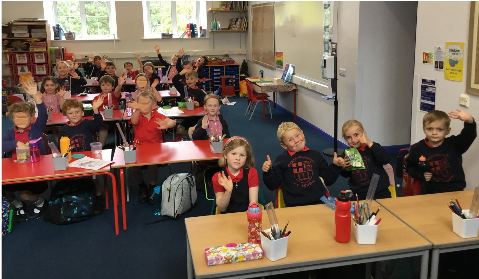
Our new Puffins just preparing their space for snack time.