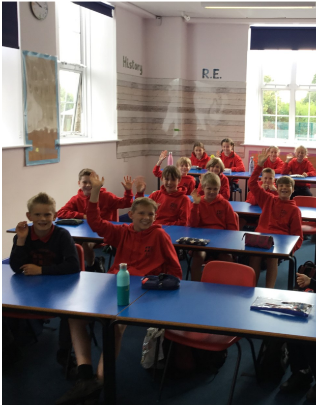
Our new Swifts enjoying their remodelled classroom with more space to move around.