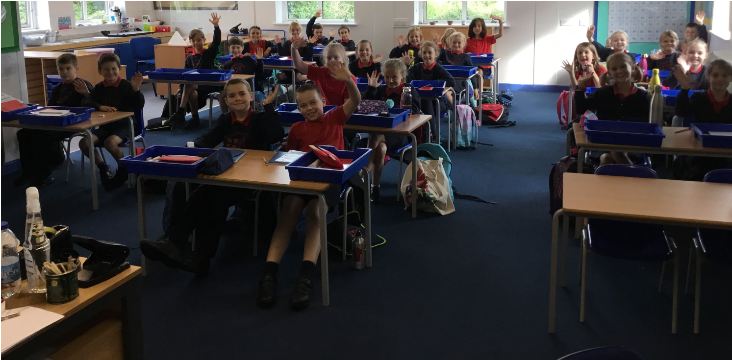
Our new Starlings in a familiar space but with a more grown up set-up!