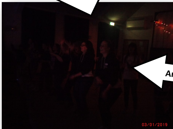
And the ladies!