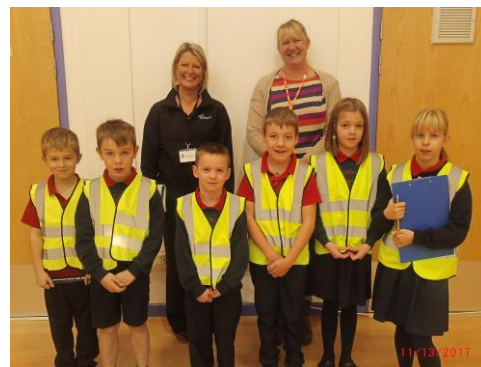
Checking the safety of our learning environment and standing proud as our Health and Safety Team!