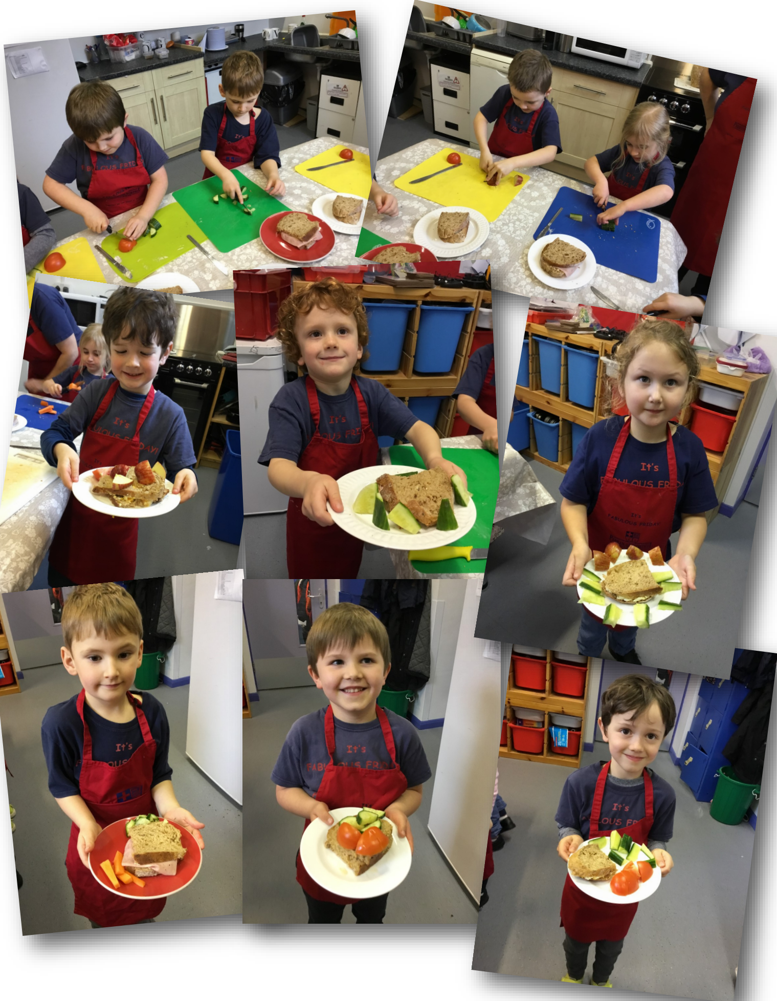
It's all in the presentation! I certainly would pay this sandwich shop a visit!