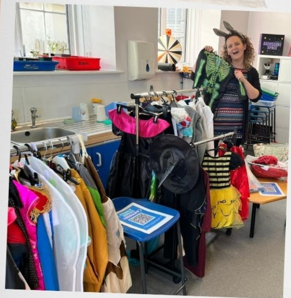
Fancy Dress Library