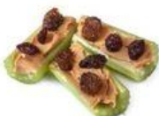
1 cup celery