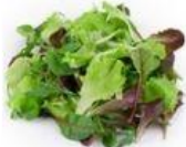
1 cup lettuce or spinach