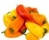
1 cup mini sweet peppers