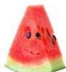
1 cup melon