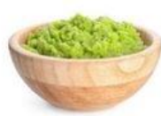
2 Tbsp. guacamole