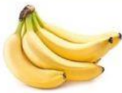
1 medium banana