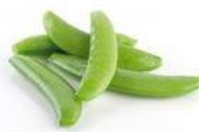
1 cup sugar snap peas