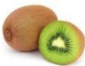
1 small kiwi