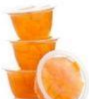
1 fruit cup, packed in juice