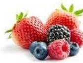
1 cup berries